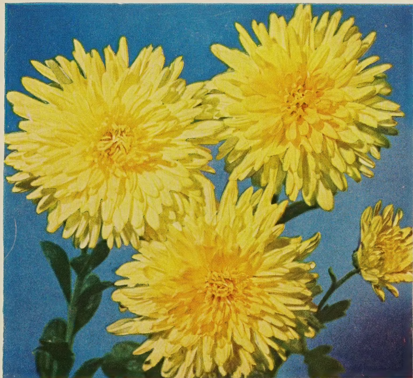
YELLOW AVALANCHE. 50c each; 3 for $1.25